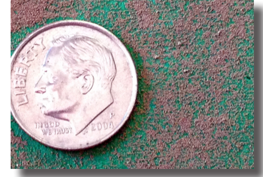
Photo shows Cosavet-DF Edge granule size. Each granule is comprised of thousands of particles averaging 2.5 microns in size.

The overall fine particle size provides a more concentrated surface area of sulfur, resulting in more and closer fungal and mite contact, more exposure to air for greater vapor action, and overall more intensive field area covered by a given application of sulfur.